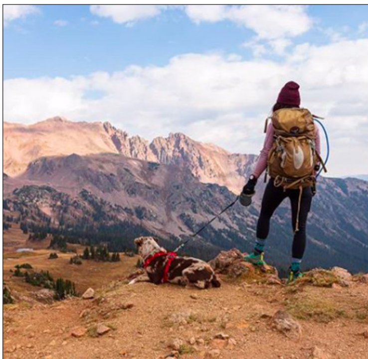
Share your photos using #ExploreSummit.