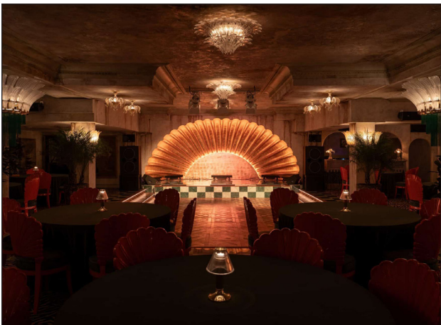
Lou Lou's Jungle Room at the Lafayette Hotel won an interior design award.