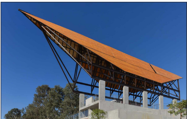
Mirador/Acesso in Tijuana was the recipient of two Orchid awards.