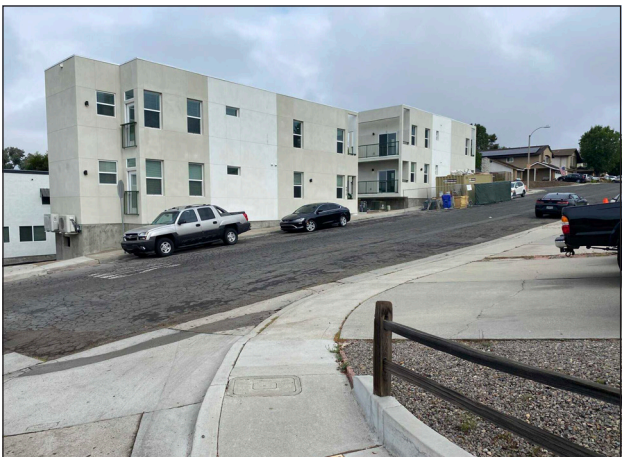
The Royal of Rancho Peñasquitos expansion was awarded an Onion. SAN DIEGO ARCHITECTURAL FOUNDATION