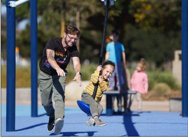
The remodeled Tecolote Shores South playground earned an Orchid for landscape architecture.

PLANS TO CHANGE THE SDMA WEST WING (ONION FOR HISTORIC PRESERVATION) Address: 1450 El Prado, San Diego. Owner/developer: San Diego Museum of Art. Jurors did not like an idea to renovate the western wing of the San Diego Museum of Art where the Panama 66 restaurant is.