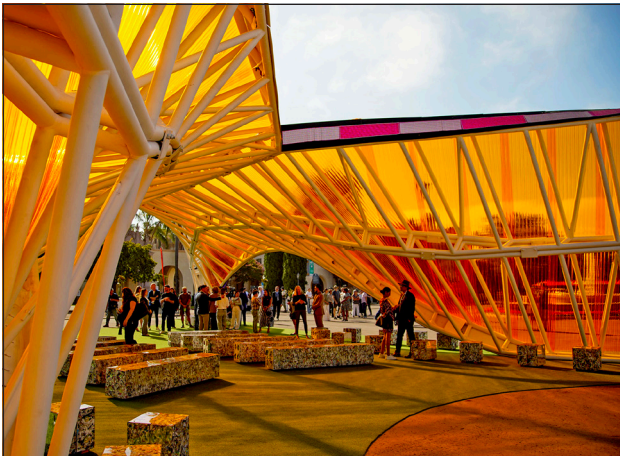
The Exchange Pavilion at Balboa Park won an Orchid for public art.