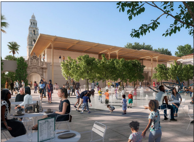
Plans for San Diego Museum of Art's new west wing got an Onion for historic preservation. FOSTER + PARTNERS