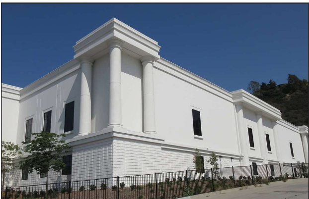
The Scottish Rite Masonic Center got an Onion for public architecture. SAN DIEGO ARCHITECTURAL FOUNDATION