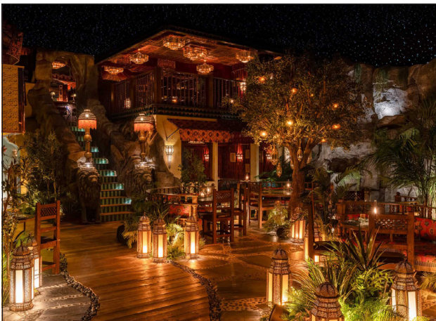
The Leila restaurant in North Park received an interior design award.