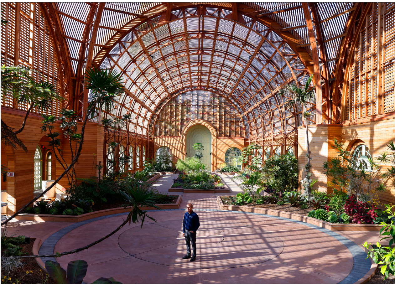
Balboa Park's Botanical Building restoration won an Orchid for historic preservation.